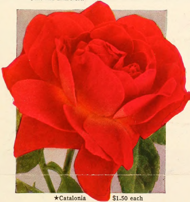
★Catalonia $1.50 each